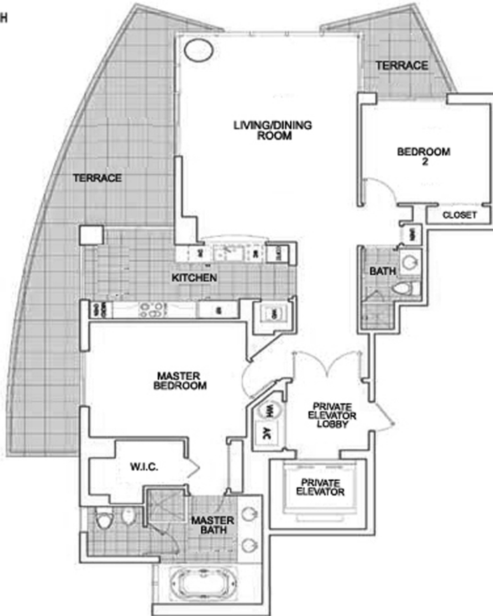
FLOOR PLAN A 1,948 sq.ft.