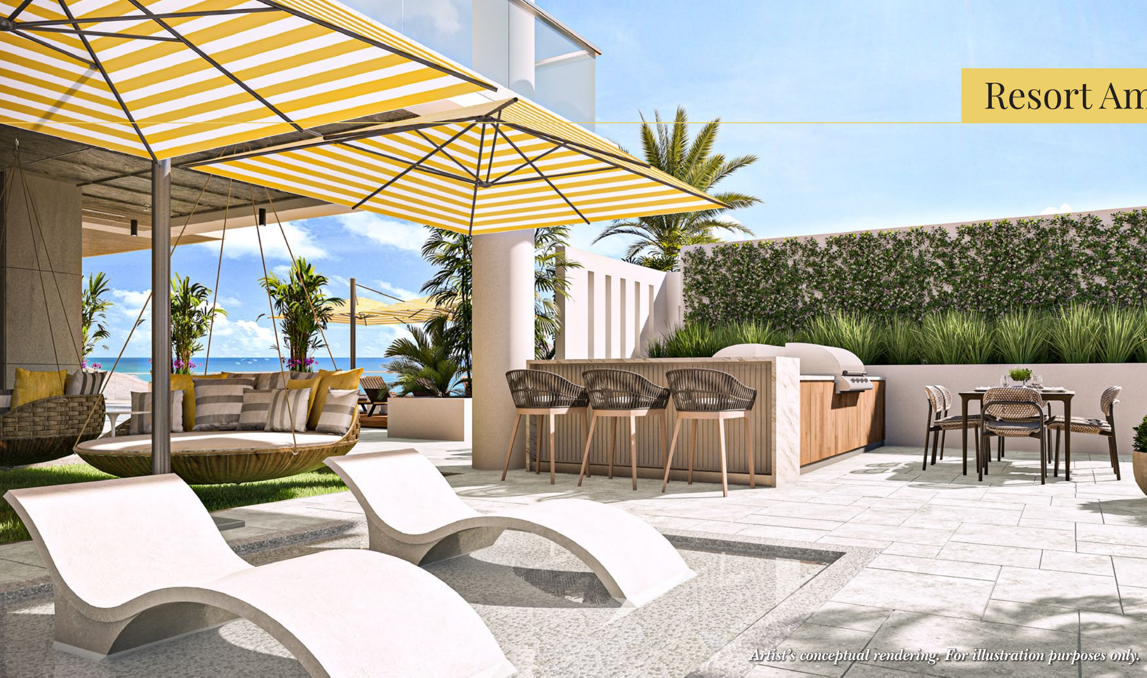
Artist's conceptual rendering. For illustration purposes only.