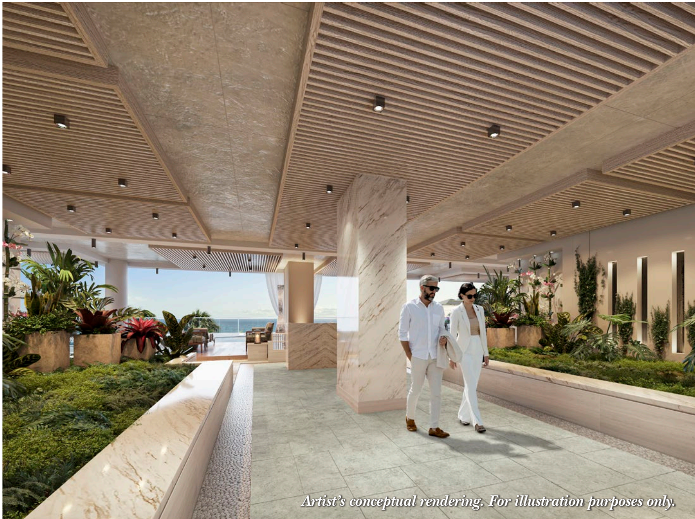
Artist's conceptual rendering. For illustration purposes only.