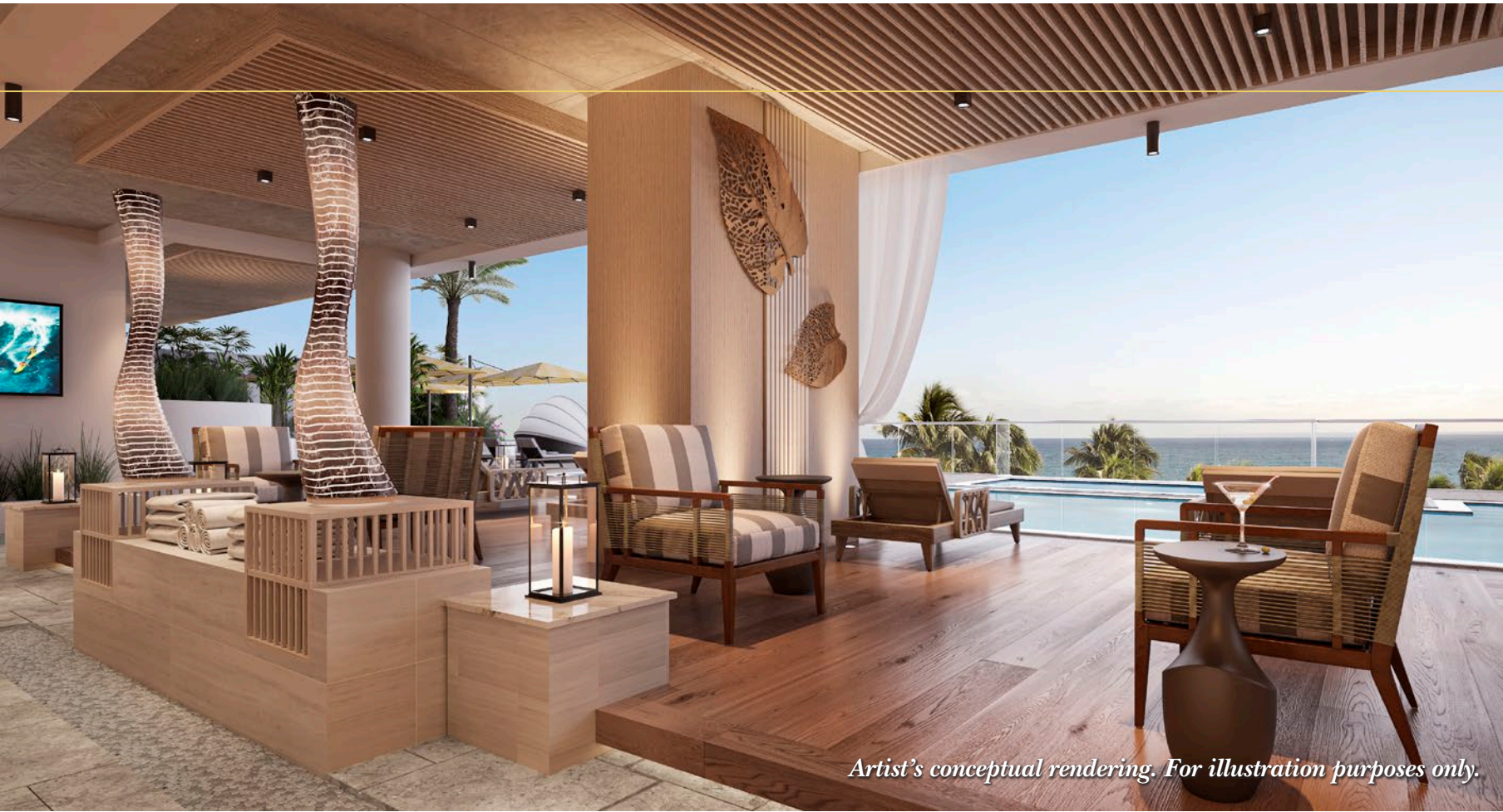
Artist's conceptual rendering. For illustration purposes only.