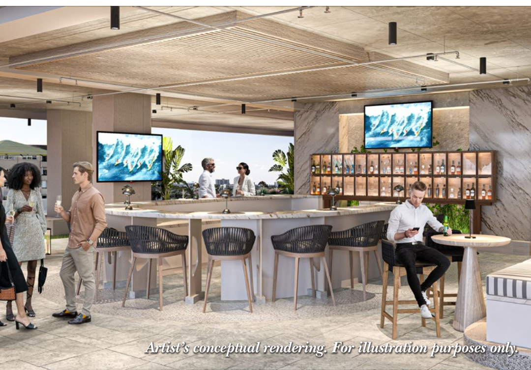
Artist's conceptual rendering. For illustration purposes only.